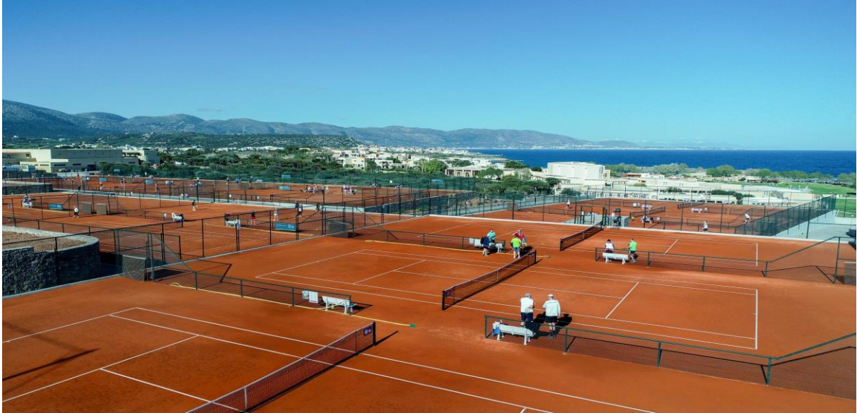
Kalimera Kriti Hotel & Tennis Center is situated on a fantastic location in Crete, Greece.